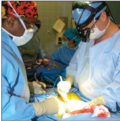
A vascular surgery procedure being performed at the Landstuhl facility.