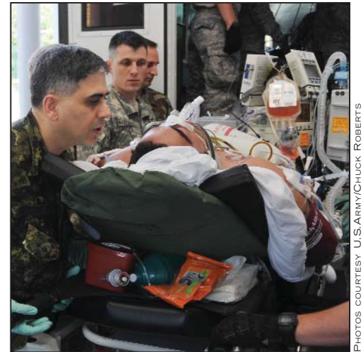
Landstuhl doctor aids in transporting patient on gurney.