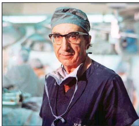
Dr. Michael Ellis DeBakey (1908-2008) was a founding member of SVS and a founding editor of the Journal of Vascular Surgery .

In 1988, SVS established the Crawford Critical Issues Forum at the annual meeting, which was soon to incorporate members of the then North American Chapter of the International Society for Cardiovascular Surgery, the forerunner of AAVS.